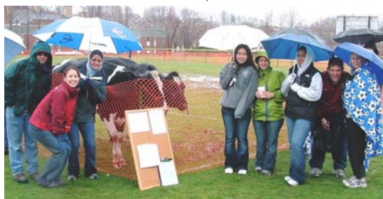
With the help of a few cows, Quinnipiac students raised $7,500 for the PAF

packages containing necessities such as toothbrushes and toothpaste, as well as nutritional snacks.