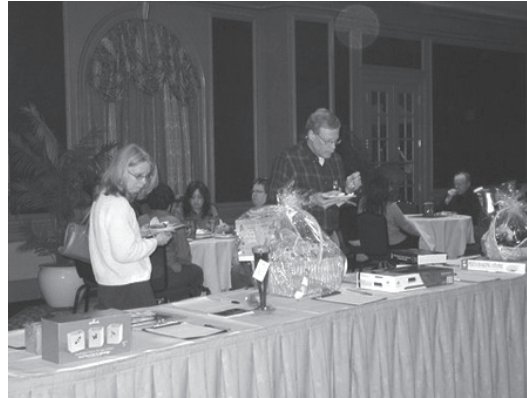
MONDAY Welcome Reception and PAF Silent Auction In the afternoon, a milk & cookie break sponsored by Sanofi Aventis