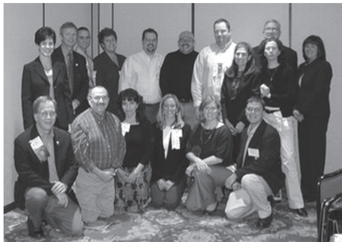
TUESDAY The ConnAPA Board of Directors posed at their annual dinner meeting