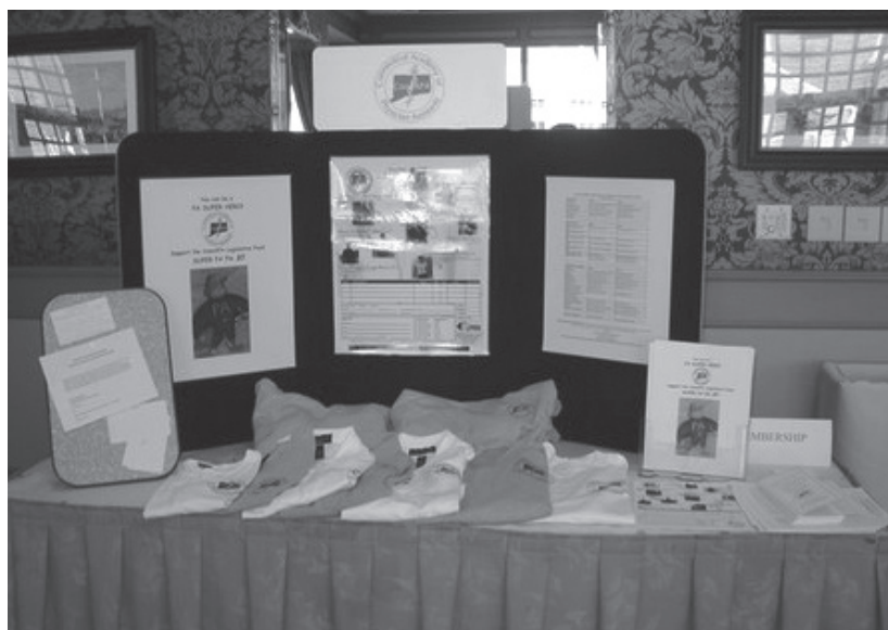
ALL WEEK Our new ConnAPA display and line of apparel