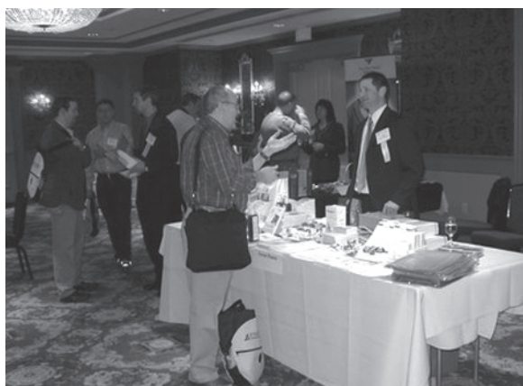
THURSDAY Shopping the Exhibit Hall Other highlights: Afternoon break refreshments and the evening Vienesse Dessert Buffet satisfied the hungriest sweet tooth and an early evening reception with hors d'oeuvres provided another opportunity to network