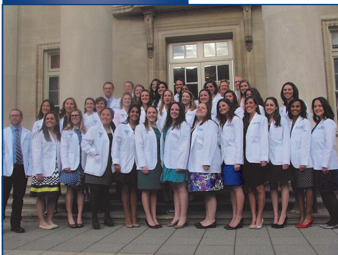
Class of 2014 White Coat Ceremony on March 22, 2013

On April 2, Yale PA students and medical students will be co-hosting a Service of Gratitude to commemorate the lives of those who donated their bodies for anatomy lab. The service will involve the students speaking about their experiences, singing, reading poetry, and presenting an artistic handmade class gift. In addition, students will be