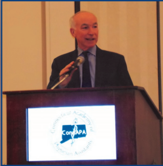
Connecticut Congressman Joe Courtney addresses the PA community during his keynote speech

The 26th Annual Charter Oak Conference has come and gone, and it once again proved to be a huge success. The conference kicked off on April 7th and ran for four days through April 10th. The staff members at the Mystic Marriott in Groton, CT were gracious hosts and provided outstanding service to all of the attendees.