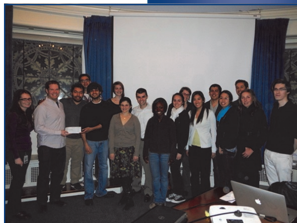
Representatives from the Yale PA Program Jack Cole Society presenting a check to the HAVEN Free Clinic board on March 24, 2013

Another exciting turning point in the year is that the Class of 2014 is working on matching big and little sibs to pair up with the incoming Class of 2015! Every year, first year students are paired with a second year mentor, to help them navigate through PA school and provide great advice. It is an exciting time, as current and incoming students are eager to get to know their future classmates!