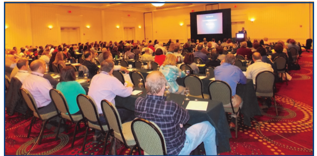
Charter Oak Conference attendees take in a lecture on Sunday morning

commenced. There was a great turnout and all who came enjoyed delicious food and good times with colleagues. This year, while enjoying the event, the attendees also perused poster presentations that students from the local universities worked so hard on during the course of their studies.