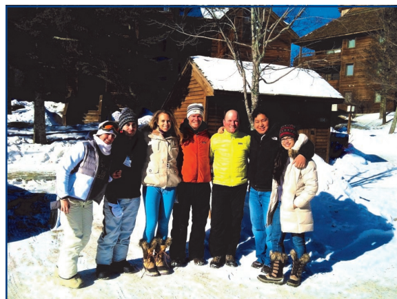
Members of the Class of 2013 on their ski trip

Coming up next, first and second year students are gearing up for conference season. On April 7 th , Yale PA students attended the annual Charter Oak Conference. Students enjoyed the lectures, challenge bowl, poster presentation, and dinner, and were excited to get to know students from the Quinnipiac and Bridgeport programs. Several students are also eager to attend the AAPA IMPACT conference this upcoming May.