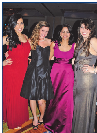
Members of the class of 2014 at the gala in Stamford