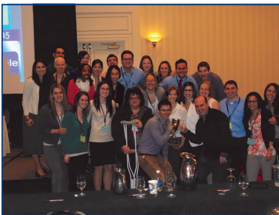
First Annual Challenge Bowl Cup winners, Quinnipiac University

After the lectures, the students participated in round table discussions with PAs of various specialties and involvements, who gave a broad view on what to expect once they finish their PA studies. Participants would probably agree that the most fun component of the SLT was the Challenge Bowl in which contestants from each of the three state PA programs competed. While the