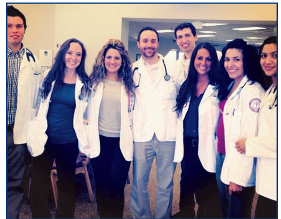
Members of the class of 2015 at their first KEEP in New Haven