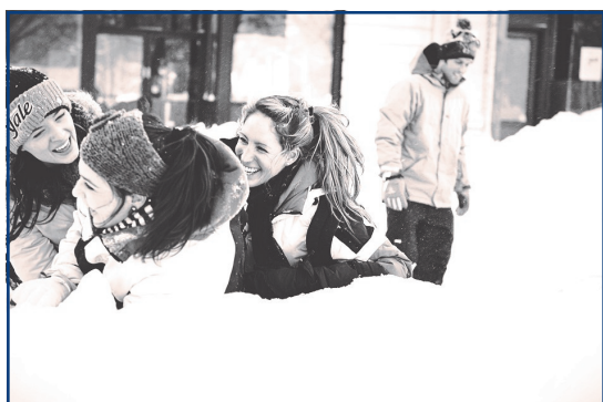
Members of the Class of 2014 playing in the streets of New Haven after the record-breaking blizzard in February.

Several students from the class also recently participated in HPREP, a program for high school students interested in science and medicine. It was a great way for PA students to speak about the different career options in medicine, answer questions, provide guidance, and serve as motivational role models. The PA students all agreed it was an inspiring and fun day and are looking forward to the next session! A number of other students have also been spending their time volunteering at clinics and halfway houses in the New Haven area, including the HAVEN Free Clinic, Neighborhood Health Project, and Columbus House. They have found their experiences working with such appreciative patients to be both educational and very rewarding.